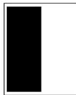
Half V Page 2.5" x 8" $100