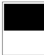
Half H Page 5" x 4" $100