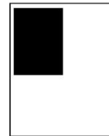
Quarter Page 2.5" x 4" $18

Make Checks Payable to: BTW Theatre Guild