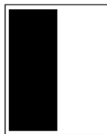
Half V Page 2.5"x 8" $80