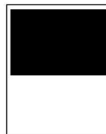
Half H Page 5"x 4" $80